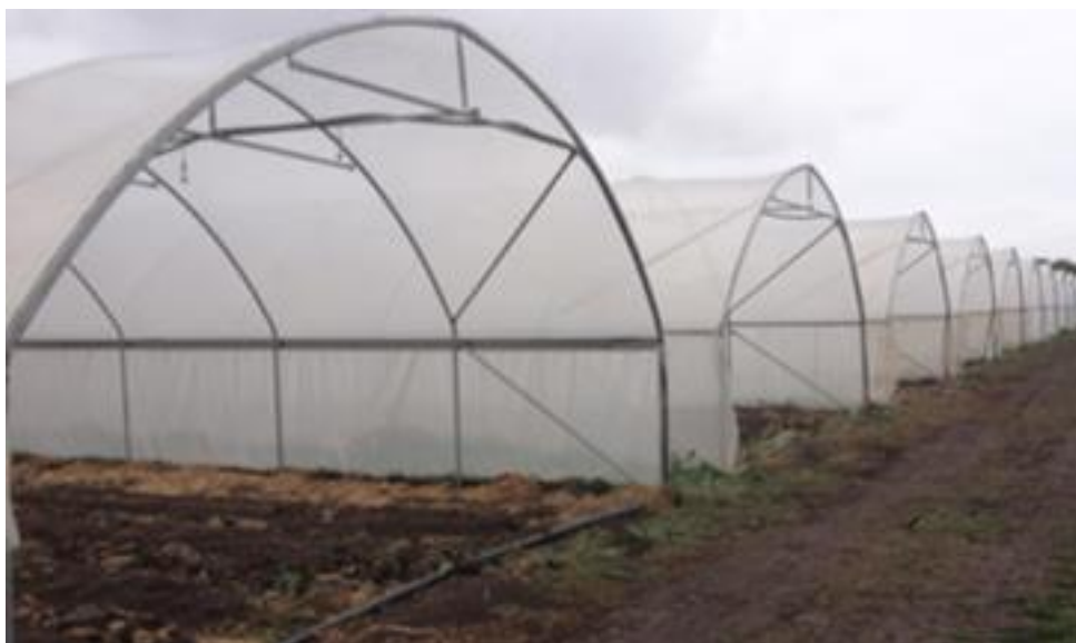
CROP COVER 1