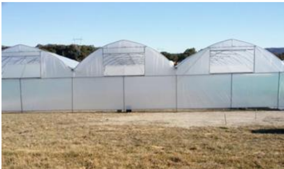
CROP COVER 2

100% relocatable, this cover gives the added benefit of being movable to any location. You can choose greenhouse film or shadecloth, or even a combination of both. We cater to your growing needs.